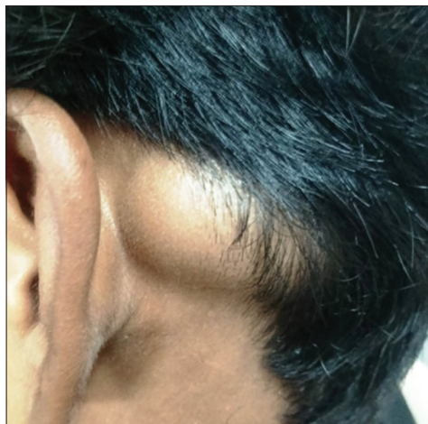
Figure 1: Pre-operative picture of the patient with postauricular swelling

On ultrasonography (USG), there was evidence of a well-defined heterogenous predominantly echogenic lesion showing internal echogenic striations measuring 42 \times 12 mm within a subcutaneous plane in the left postauricular region. The underlying bone showed a normal cortical surface.