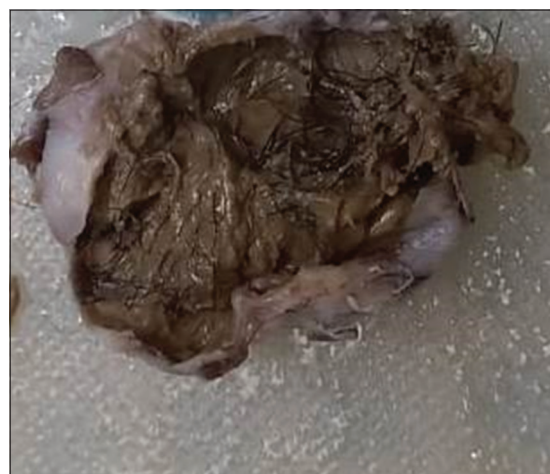
Figure 3: Excised cyst showing pultaceous material along with hair tuft inside the cyst cavity